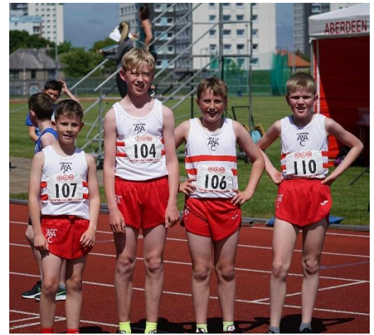
U13 Boys – RAM League