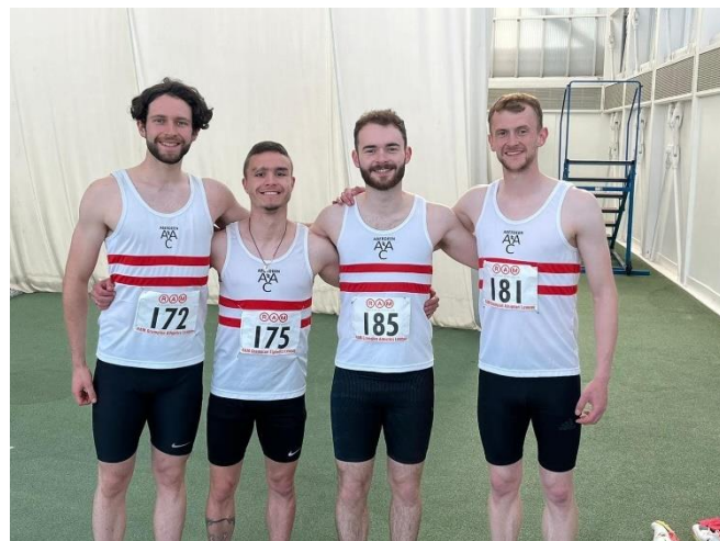
Mens 4x100m – RAM League

Aberdeen AAC did not finish any teams in the 2022-23 East League.