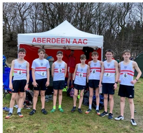
U15 Boys at Deans