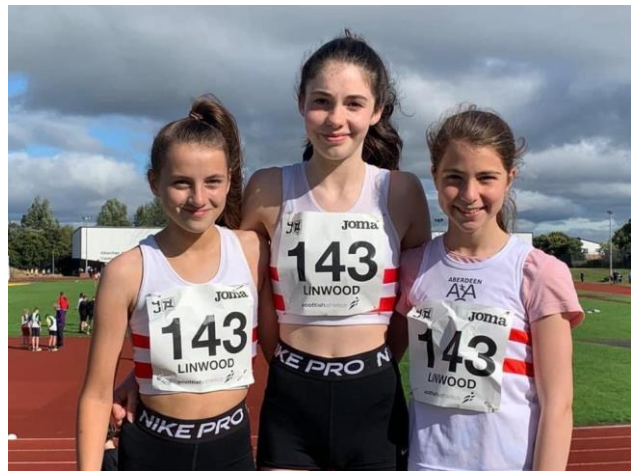
Girls U15 Track Relays Team