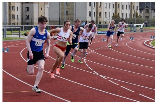
OGM – May 2021