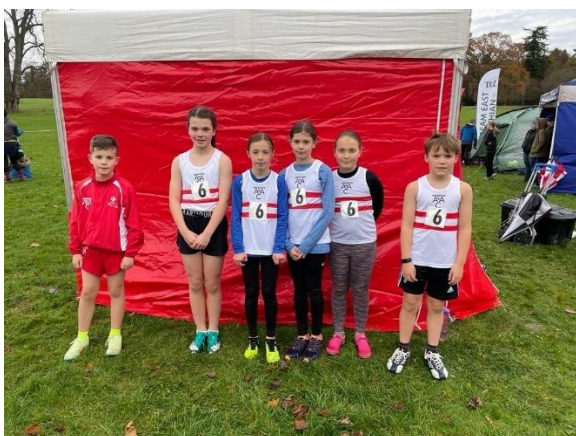
U11's at Camperdown

NB Figures in brackets denote aggregate match scores where clubs are tied on league points