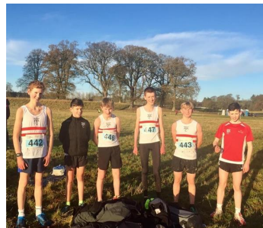
U15 Cross Country