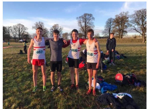
U17 Cross Country