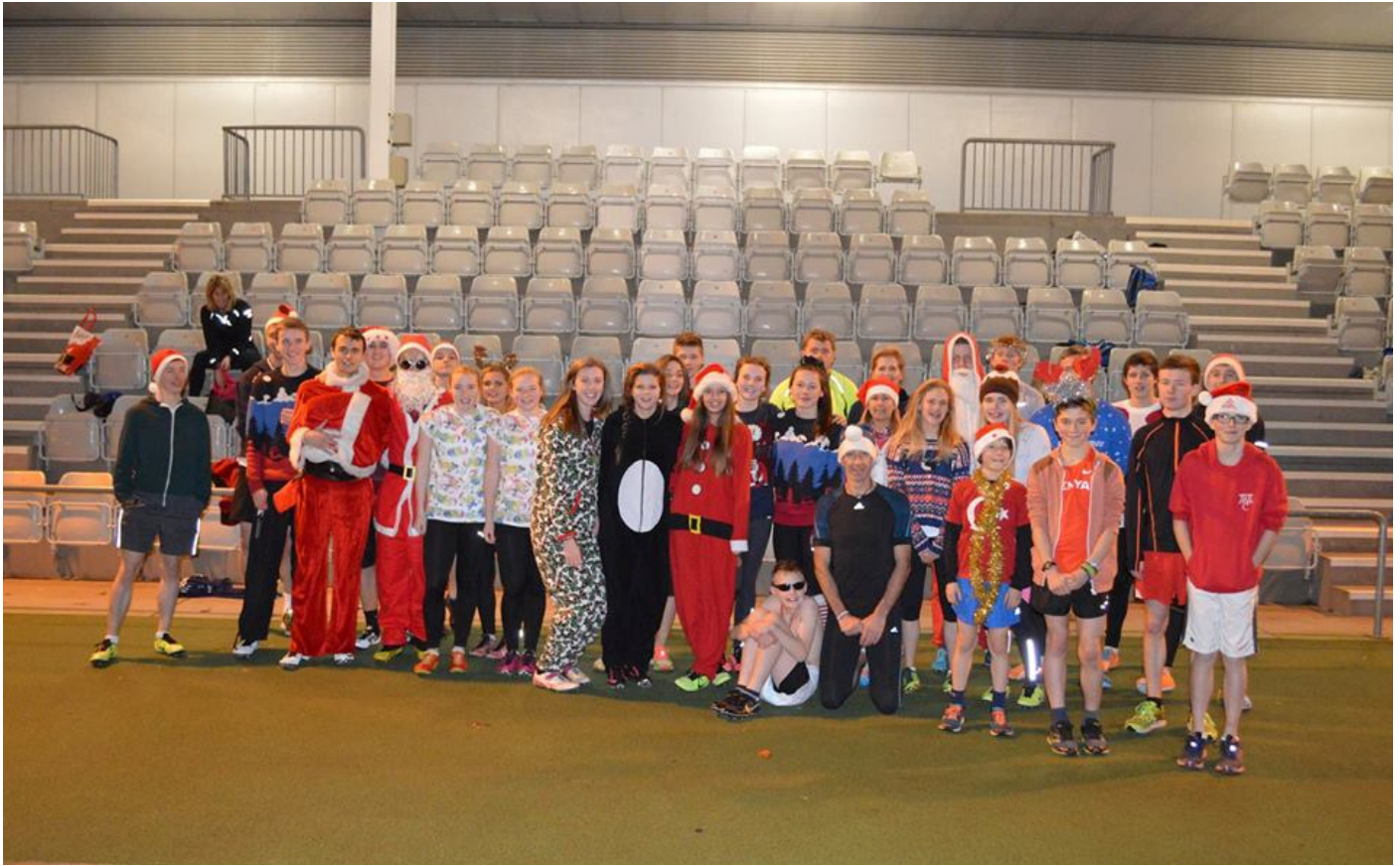
Club members who took part in the 2014 Christmas Relays